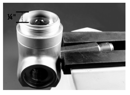
Figure 8 Adjustment Screw Pre-setting