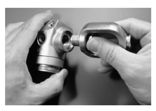
Figure 9 Installing Yoke Clamp Assembly