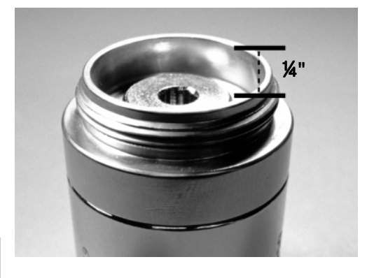
Figure 13 Adjustment Screw Pre-setting